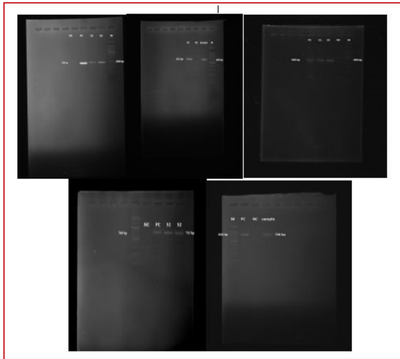
Figure 1. Images related to genotypic study of cluster colonies with carbapenem resistant genes