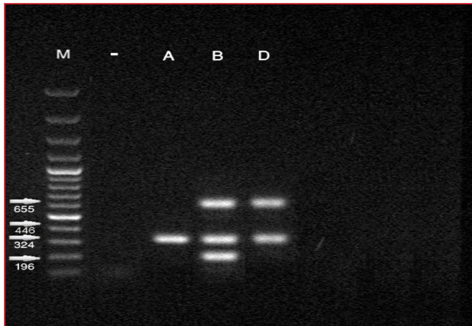
Figure 2. A PCR gel electrophoresis image of C.perfringens types on agarose gel 1% using specific primers. M: marker, -: negative control