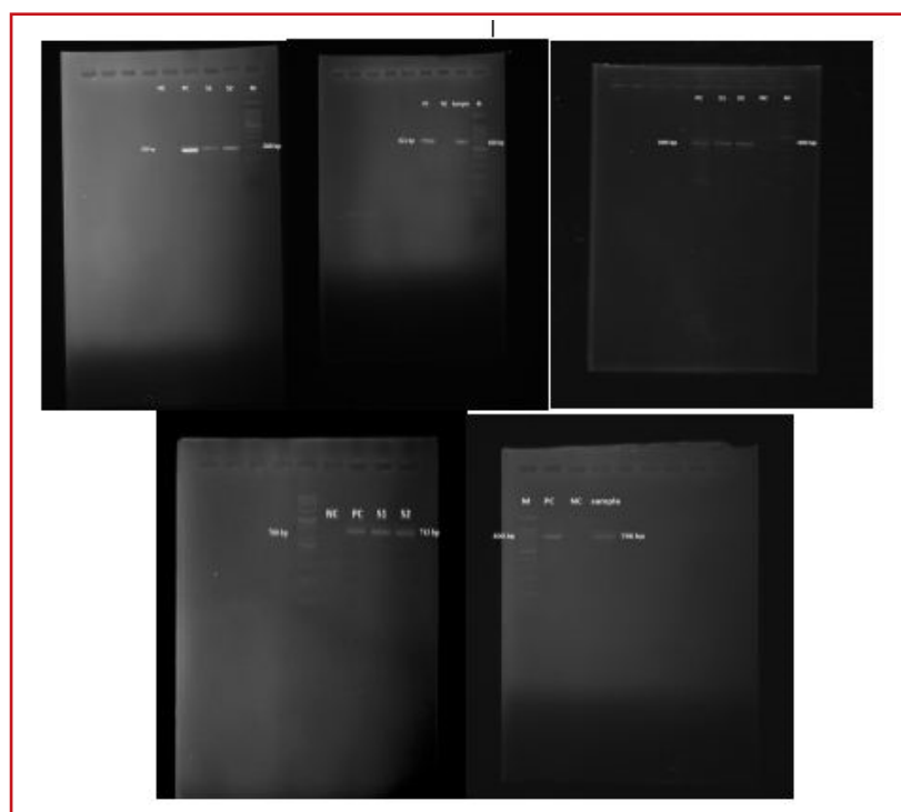
Figure 1. Images related to genotypic study of cluster colonies with carbapenem resistant genes