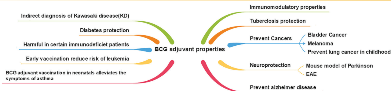
Figure 2. The different effects of adjuvant BCG on components of the immune system and diseases like autoimmune disease and cancers.

Despite its efficacy in non-obese diabetic mice, BCG vaccination is ineffective in preventing diabetes in humans (33, 34). Studies in a mouse model have suggested that BCG vaccination may prevent AD (35).