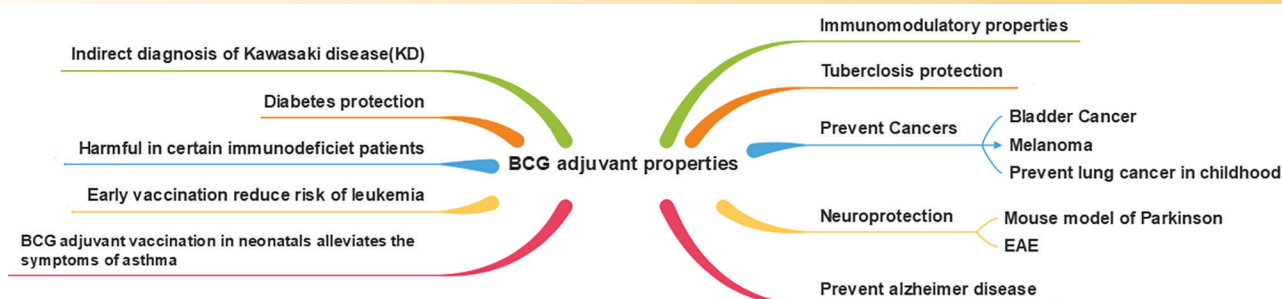
Figure 2. The different effects of adjuvant BCG on components of the immune system and diseases like autoimmune disease and cancers.

Despite its efficacy in non-obese diabetic mice, BCG vaccination is ineffective in preventing diabetes in humans (33, 34). Studies in a mouse model have suggested that BCG vaccination may prevent AD (35).